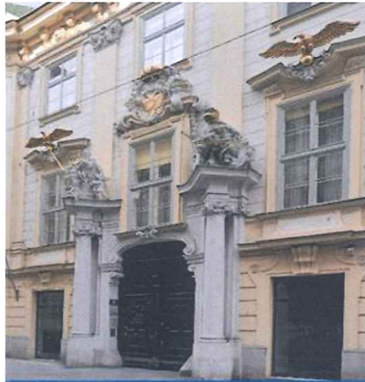
CONFERENCE: Old Town Hall Vienna Wipplinger Straße 6-8