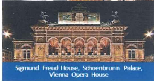
Sigmund Freud House, Schoenbrunn Palace, Vienna Opera House