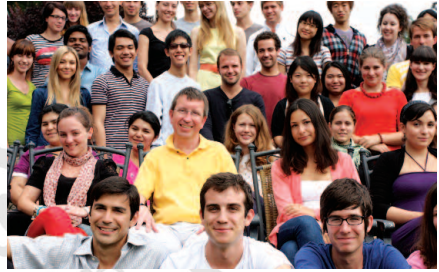
Have a good time at the Sommerhochschule

Students from all over the world have been drawn to the program, not only because of the outstanding academic reputation of its European Studies courses and the excellent opportunities it offers students to learn German, but also because of its location directly on the shores of one of Austria's most scenic lakes, Lake Wolfgang, in the Salzkammergut region, and because of the area's excellent sports and recreational facilities .