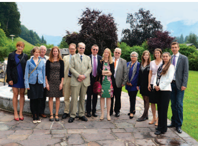
Left: Faculty and friends of the Sommerhochschule at the Opening Ceremony 2014